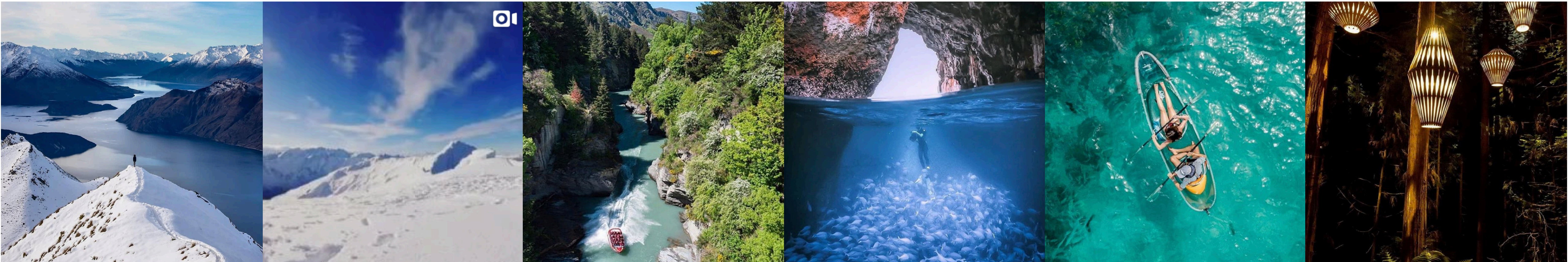
Images from Gotta Love NZ Instagram

Get in front of a massive audience of people looking for inspiration on what to do in New Zealand