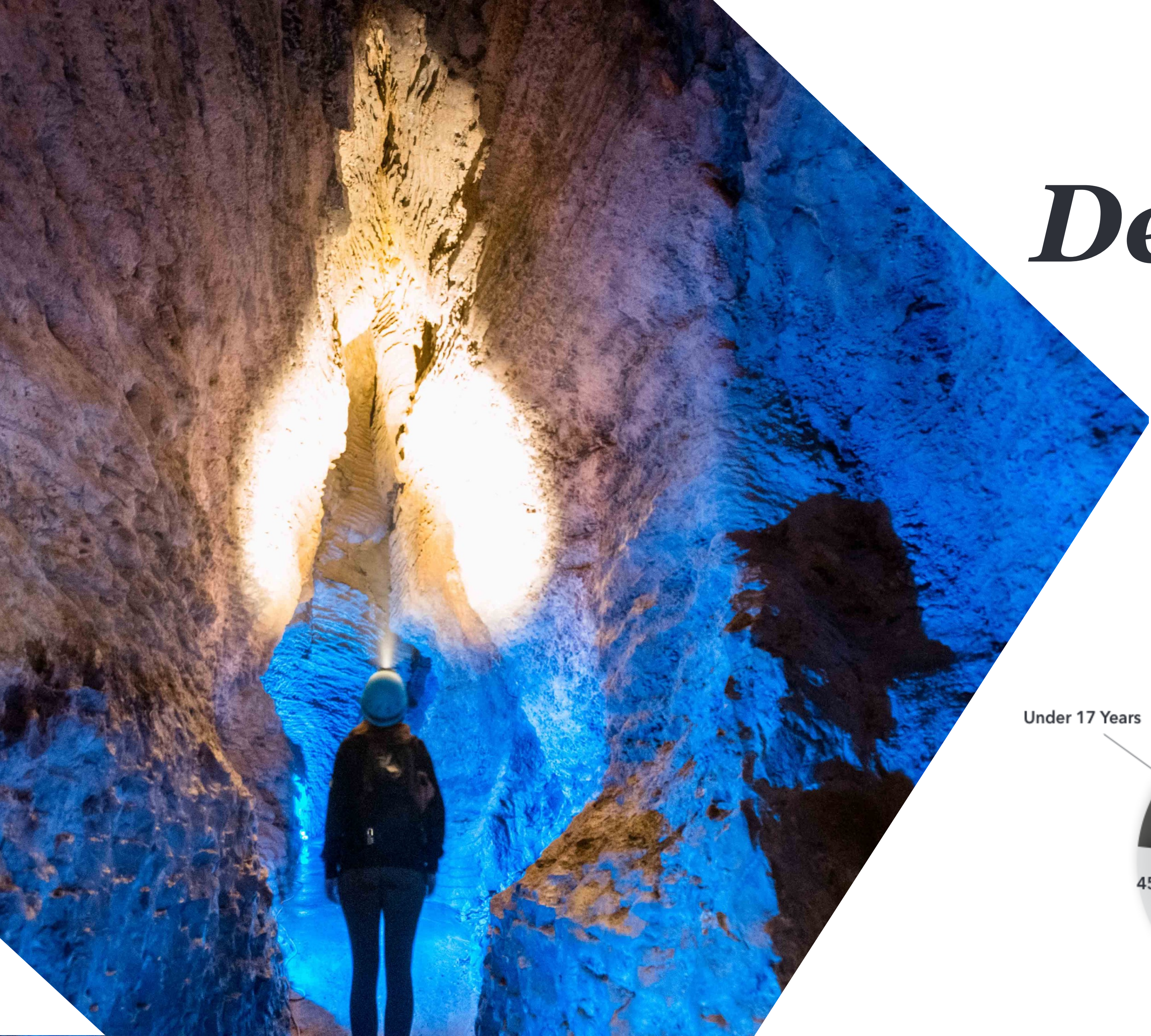
Top 5 Global Locations